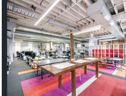
44 Bay Street Ultimo, NSW